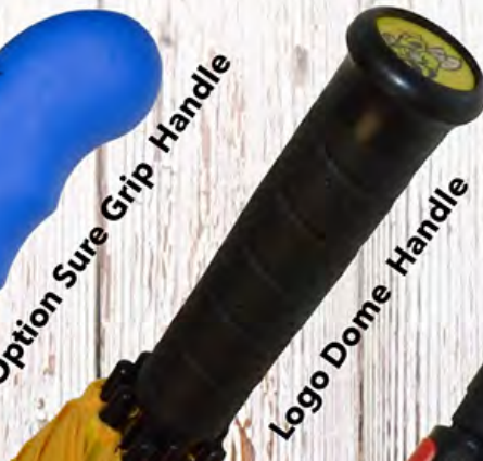
Logo Dome Handle