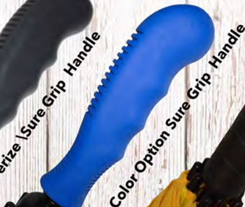
Color Option Sure Grip Handle