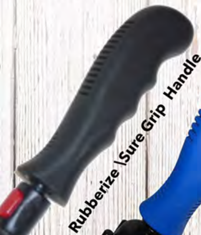
Rubberize | Sure Grip Handle